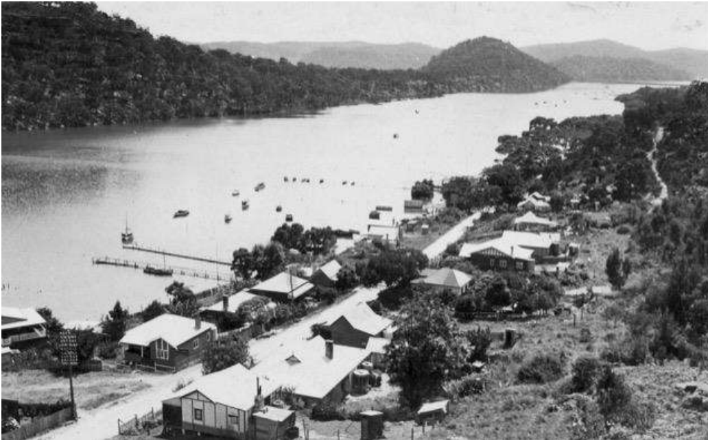
This photo shows most of the Cole property as it was in 1938. Wharf Street is at bottom left.

These days, it is natural to think of the area around the station as being the oldest part of Brooklyn, but settlement occurred from the other end because the 1848 road provided a connection with the outside world long before the railway arrived in 1887.