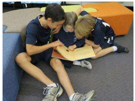
Peer learning with Year 6 and Kindergarten