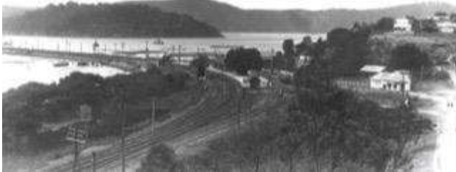
Figure 1 Dangar Road in about 1920