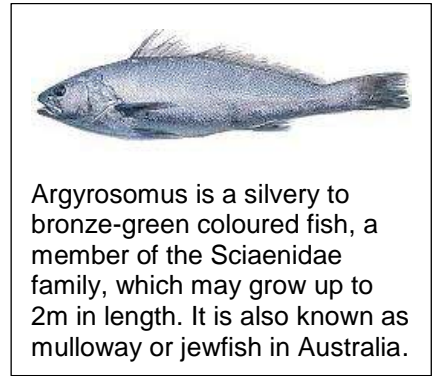
Argyrosomus is a silvery to bronze-green coloured fish, a member of the Sciaenidae family, which may grow up to 2m in length. It is also known as mulloway or jewfish in Australia.