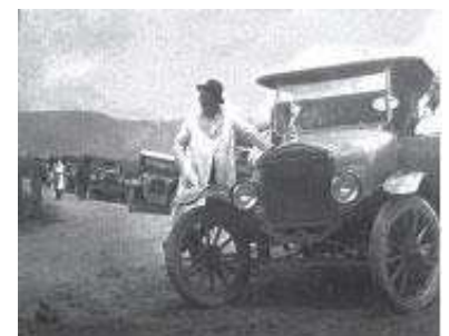
All you needed was a white dust-coat and a leather bag and the customers paid up. Car queue for the ferry about 1938.