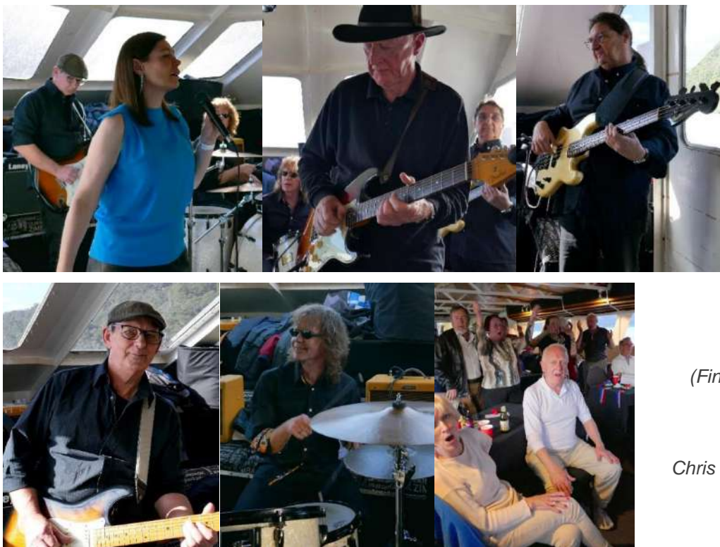
(Final pic is the crowd singing back the refrain of 'I Got My Mojo Working'.)

Look out for our new (and first time) Christmas Party Blues Cruise X in December, and then our traditional Summer Blues Cruise XI in February. Hopefully Covid-safe regulations will be relaxed, and capacity will be increased in time for each of these cruises.