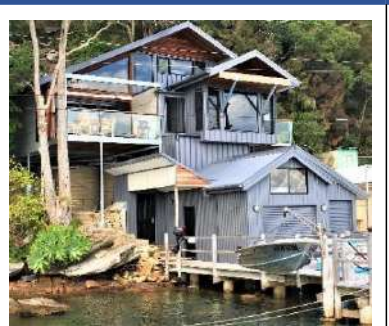
Brooklyn, Dangar Island, Mooney Mooney, Cheero Point, Little Wobby

Liz Surrest 0420 759 004 liz@eastcastle.com.au Licenced Agent #303170