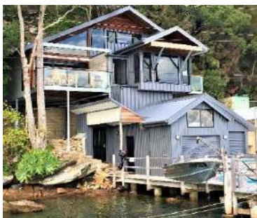
Brooklyn, Dangar Island, Mooney Mooney, Cheero Point, Little Wobby

Liz Surrent 0420 759 004 liz@eastcastle.com.au Licenced Agent #303170