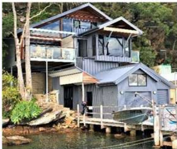
Brooklyn, Dangar Island, Mooney Mooney, Cheero Point, Little Wobby

Liz Surrent 0420 759 004 liz@eastcastle.com.au Licenced Agent #303170