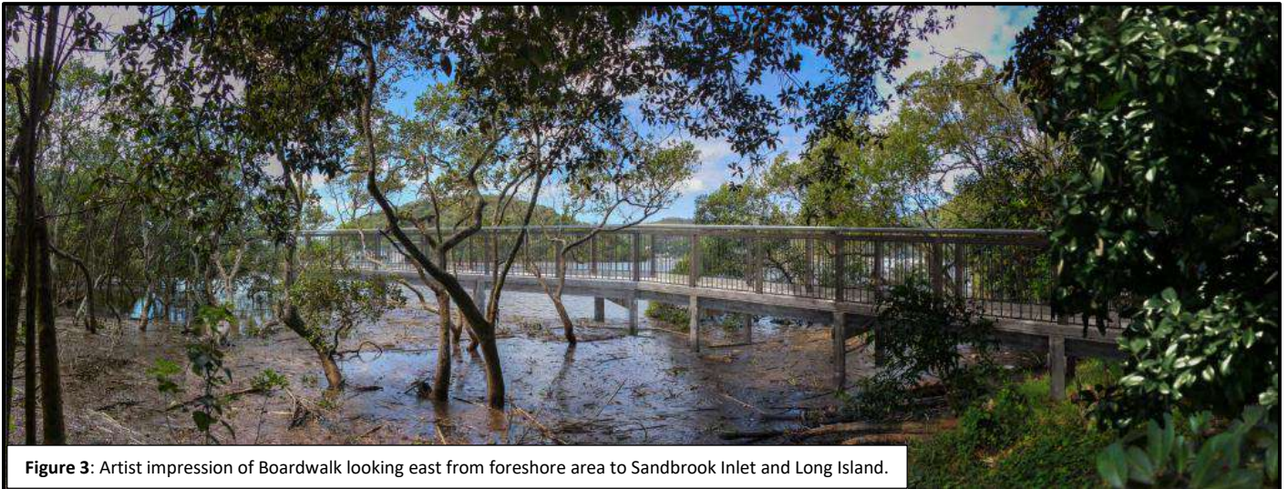
Figure 3: Artist impression of Boardwalk looking east from foreshore area to Sandbrook Inlet and Long Island.