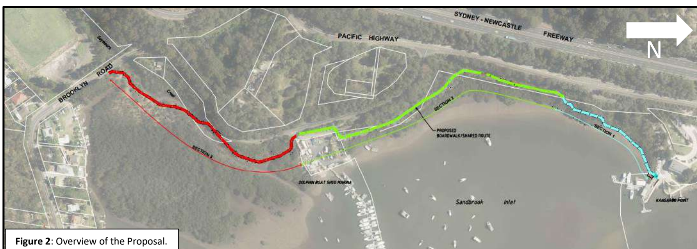
Figure 2: Overview of the Proposal.

Section 3: Approximately 360 m long boardwalk (red in Figure 2) that commences on the southern side of the marina and meanders through mangroves before crossing Seymours Creek and continuing through a wetland area before connecting with the existing footpath at Brooklyn Road.