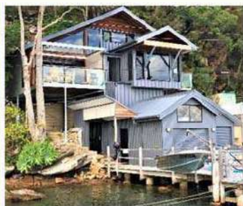
Brooklyn, Dangar Island, Mooney Mooney, Cheero Point, Little Wobby

Nooney Men's and Women's Bowls Clubs are laying down the challenge! We're hosting an evening of FREE Twilight Bowls and we are out to grab a newbie to "Have a Go". Don't be surprised if you get a tap on the shoulder in the next few weeks. We'll supply the music, action, fun, food, equipment plus prizes thrown in on the night. All we need is you! Come along - we guarantee you'll have a great time. All enquiries welcome. Call Anastasia on 0400 213 326.