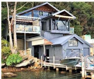
Brooklyn, Dangar Island, Mooney Mooney, Cheero Point, Little Wobby

send your event details to emails@brooklyncommunity.org.au