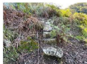
19 February 2023