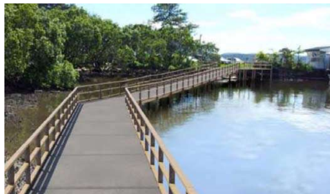
Potential boardwalk to Kangaroo Point