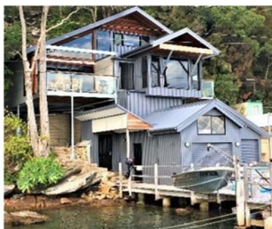
Brooklyn, Dangar Island, Mooney Mooney, Cheero Point, Little Wobby

send your event details to emails@brooklyncommunity.org.au